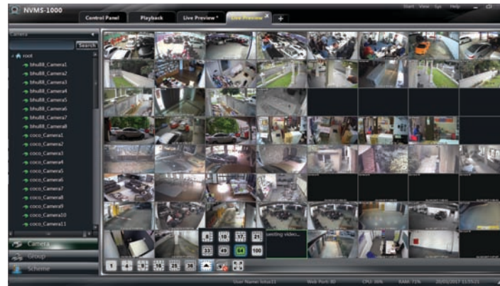
Centre Control & Monitoring Interface